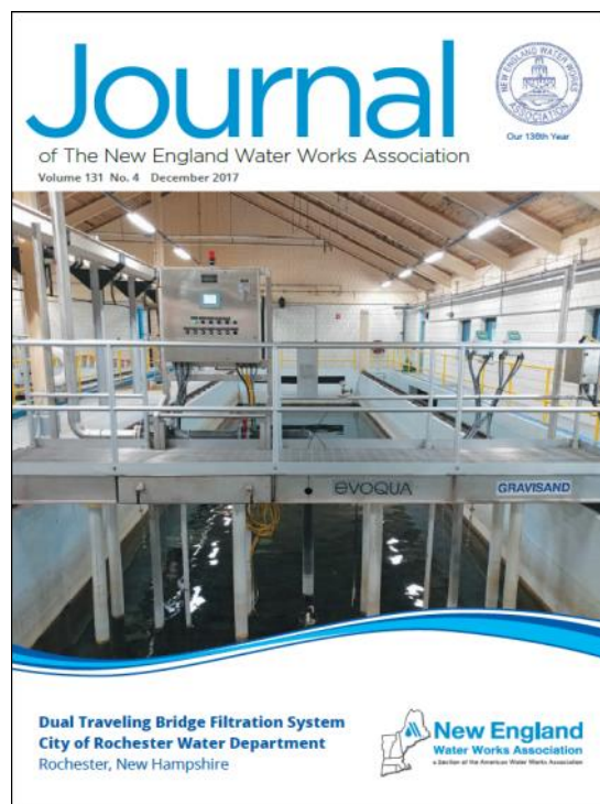
Reprinted from the Journal of NEWWA, Vol. 131 (No. 4) by permission. Copyright © 2017 The New England Water Works Association.