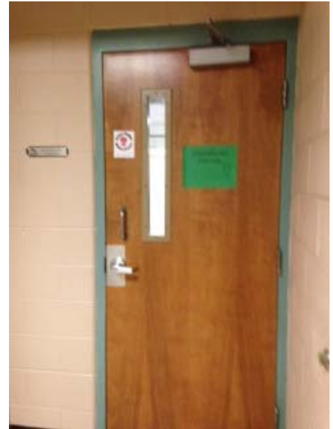
Three doors that need automatic openers