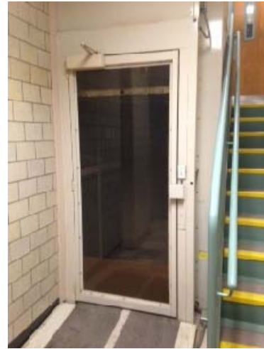
Existing man lift views as seen from the 3 stop locations