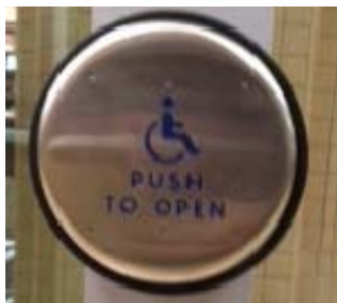
Typical push button